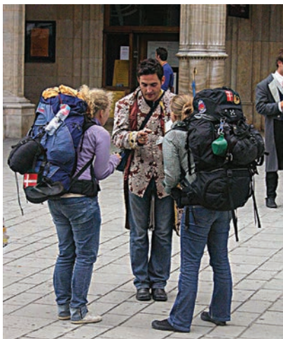
Kurt Forstner / Creative Commons