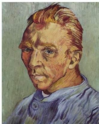
Self-portrait without beard - Vincent Van Gogh, 1889. Private Collection.

"[...] I have often neglected my appearance. I admit it, and I also admit that it is "shocking." But look here, lack of money and poverty have something to do with it too, as well as a profound disillusionment, and besides, it is sometimes a good way of ensuring the solitude you need, of concentrating more or less on whatever study you are immersed in."