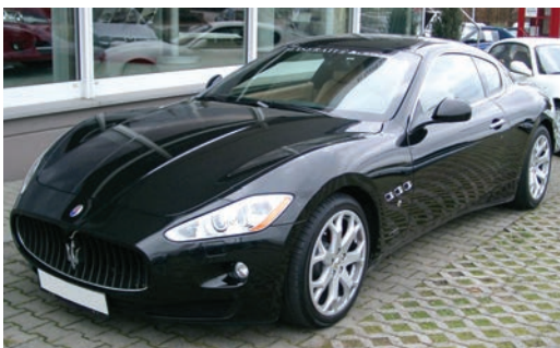
Rudolf Stricker / Creative Commons