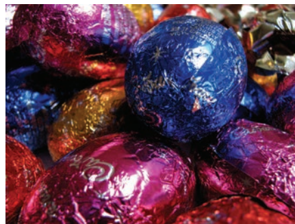
Colored Easter eggs in the United States

Throughout the English-speaking world, many Easter traditions are similar with only minor differences. For example, Saturday is traditionally spent decorating Easter eggs and hunting for them with children on Sunday morning, by which time they have been mysteriously hidden all over the house and garden.